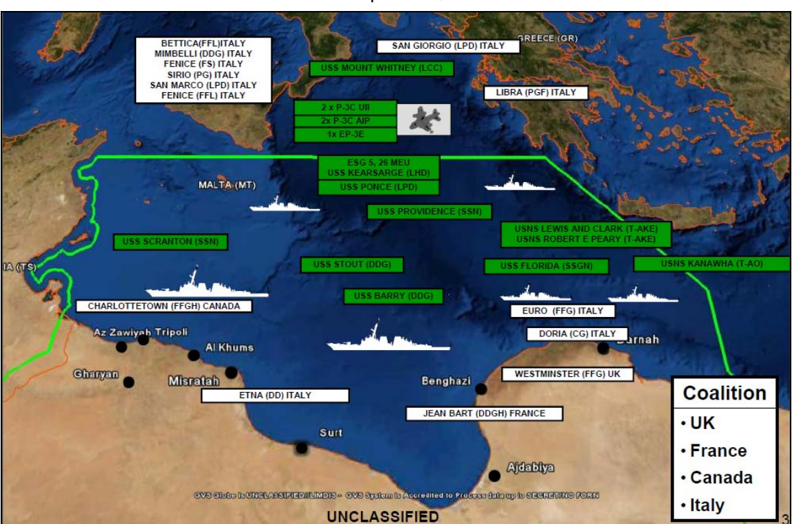
Figure 3. Maritime Assets in Operation Odyssey Dawn As of initiation of operations, March 19, 2011

As part of a 25-hour round trip mission, the B-2s struck combat aircraft shelters at Ghardabiya Airfield in the opening hours of Operation Odyssey Dawn. The F-15Es and F-16CJs attacked ground forces loyal to Qadhafi that were advancing on opposition forces in Benghazi and threatening civilians. KC-135s refueled the strike aircraft en route to an unnamed forward air base, and the C-130Js moved ground equipment and personnel to that forward base, as did theater-based C-17s.<sup>36</sup>